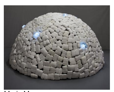
Mario Merz Igloo di Marisa, 1972 Metal structure, fabric, neon, Plexiglas 300 x 150 cm © Private collection / Kunstmuseum Liechtenstein, Vaduz; photo: G. Persano

Igloo de Marisa is distinguished by its surface made of fabric cushions. Its prototype was exhibited in Düsseldorf for Prospect 1968 , recreated for Documenta 5, the first time Mario Merz was invited to participate in that major exhibition. The artist worked there while designing a matching igloo, meant to be exhibited at the 36th Venice Biennale, held that same year, 1972. A sequence of neon Fibonacci numbers in neon are installed on the surfaces of the two igloos. This industrial element is superimposed on the manual work evoked by the upholstery. This major work by Mario Merz reveals the intimate complicity of the two artists.