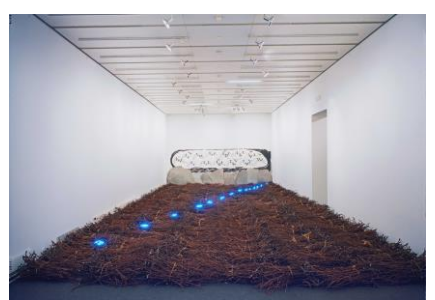
Mario Merz Untitled, 1985 Mixed media on paper, stones, bundles of sticks, neon Approximately 1400 x 700 x 200 cm

In 1985, Mario Merz received the Prix de la Banque Hypothécaire du Canton de Genève (BCG), receiving a monetary sum and an exhibition at the MAH, in return for which he donated a work to the museum. As a result, the work became part of the MAH collection.